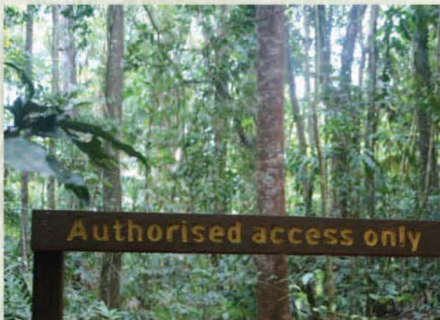
The site has authorised access only to help growth.