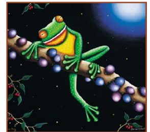
'Sleep Frog' (26 x 20 cms) .

Prints such as 'Sleep Frog' (pictured right) individually signed by the artist are $22.00 each; greeting cards are $5 each.