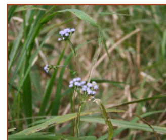
They may look pretty but they have to go – join us to find out how.