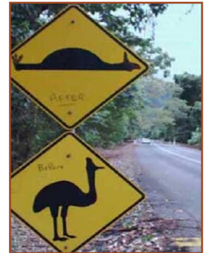
A locally 'adapted' sign in the Daintree, too often proven too true.