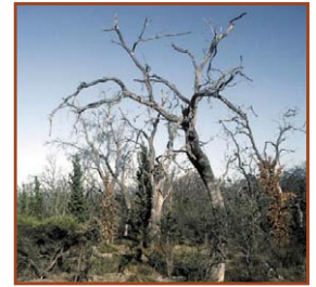
Dieback caused by the phytophthora root rot fungus affects a wide variety of ecosystems, such as the banksia woodland shown here.