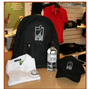
Think Christmas shopping now – plan ahead, save money and help save Australia's rainforests.

To see the full range of Operation Big Bird merchandise visit the ARF gift shop and interpretive centre located at 51 Esplanade, Cairns or for mail-orders call us on (07) 4041 1489. Keep watching our website for on-line shopping coming soon.